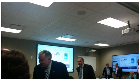
Figure 1 Secretary Robert McDonald at MyVA Advisory Committee meeting held at Primary Care Annex, Tampa Florida

The MyVA Advisory Committee arrived at James A Haley VA Primary Care Annex on 14-15 Oct 2015 for its fourth meeting this year. My VA